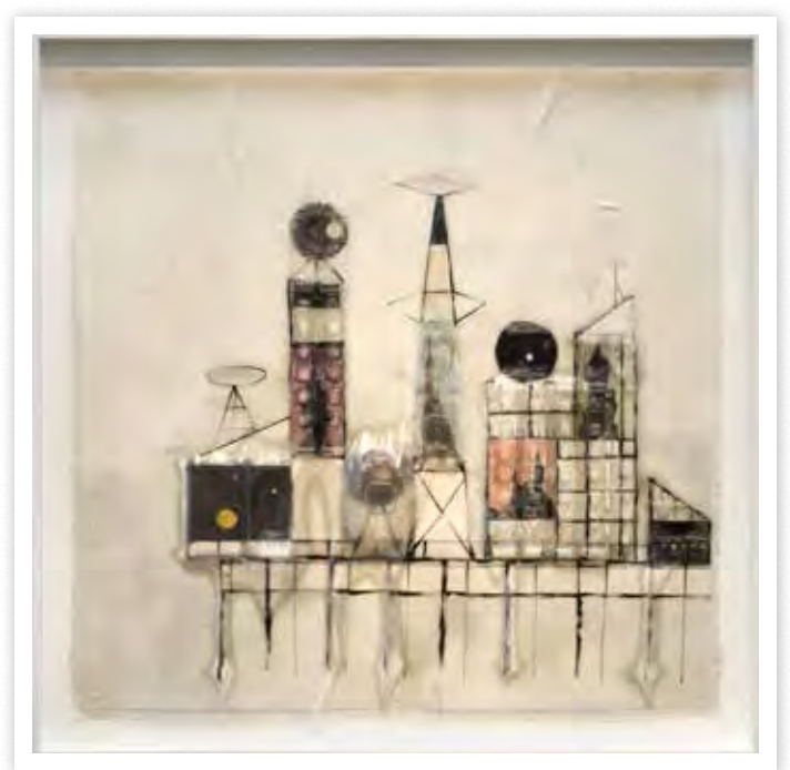
ABOVE LEFT: "Pier Two," 2014 – ink, acrylic, plastic, bio-resin, fiberglass on paper – courtesy of Shoshana Wayne Gallery ABOVE RIGHT: "Listening Platform," 2015 – ink, acrylic, plastic, bio-resin, fiberglass on paper – courtesy Shoshana Wayne Gallery.