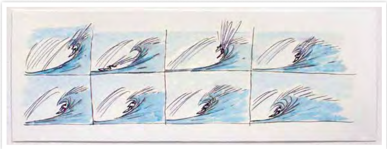
BELOW: "Estero Rush," 2010, Ink and gouache on paper. BOTTOM: Work in progress on "Around the Vast Blue," a 60-inch globe commissioned for the Nevada Museum of Art's 2015 exhibition, "Tahoe: A Visual History."